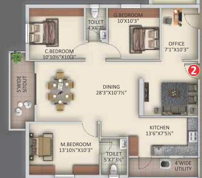
2 3BHK - 1570sft