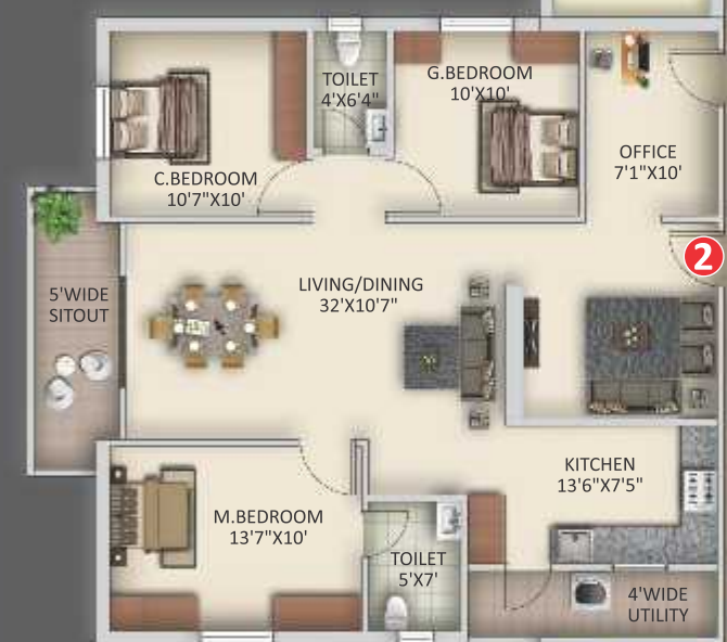
2 3BHK - 1570sft