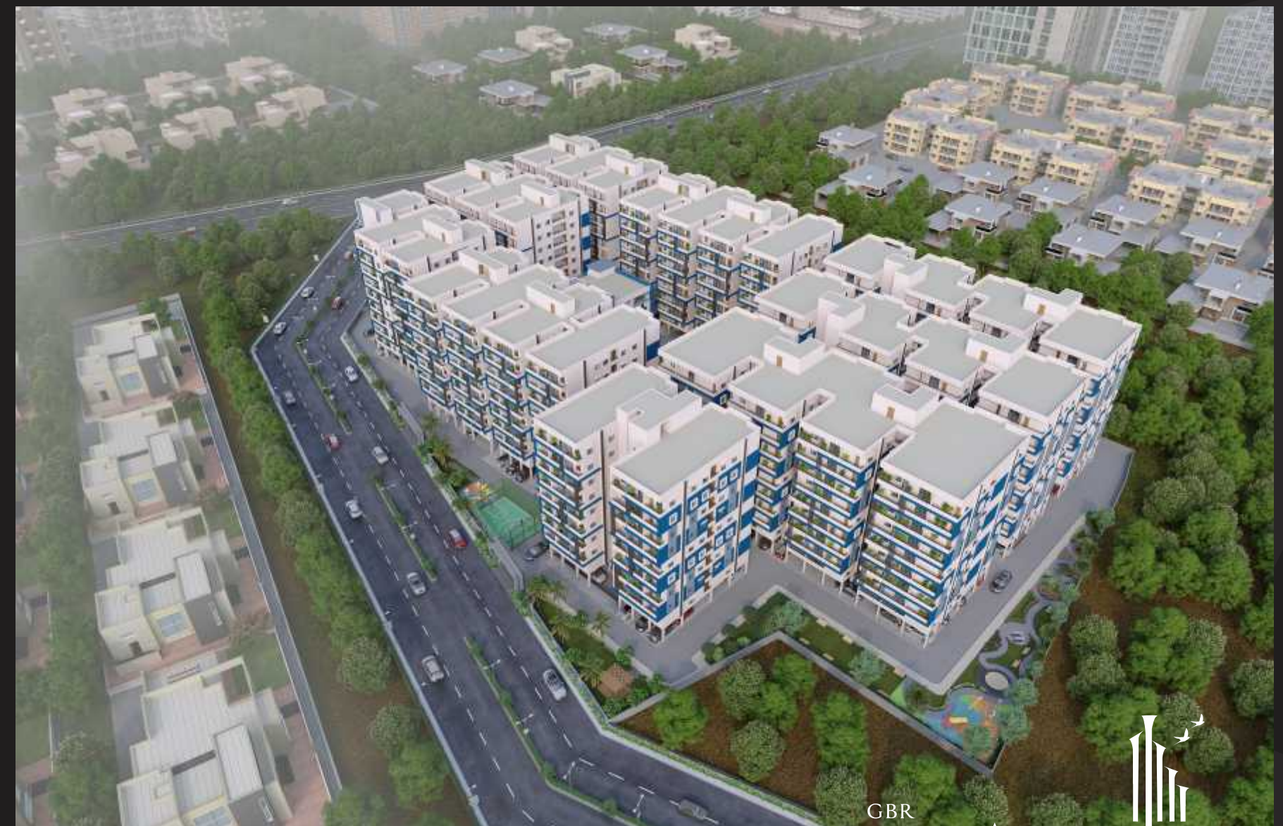
an artistic rendering of gbr dhanwin birds eye view

With over large open space and lush greenery all around, Dhanwin Towers is an oxygen-rich address. The sleek minimalist architecture stands out on lush grounds and offers opulent apartments with active outdoors and clubhouse amenities. Live it up here!