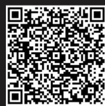
LOCATION QR CODE