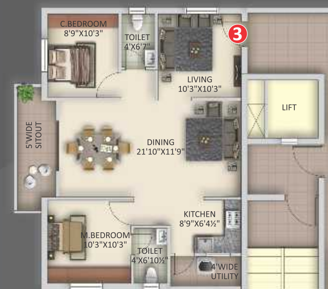
3 2BHK - 1165sft