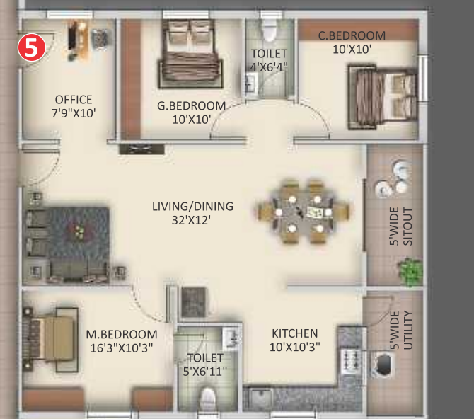
5 3BHK - 1670sft