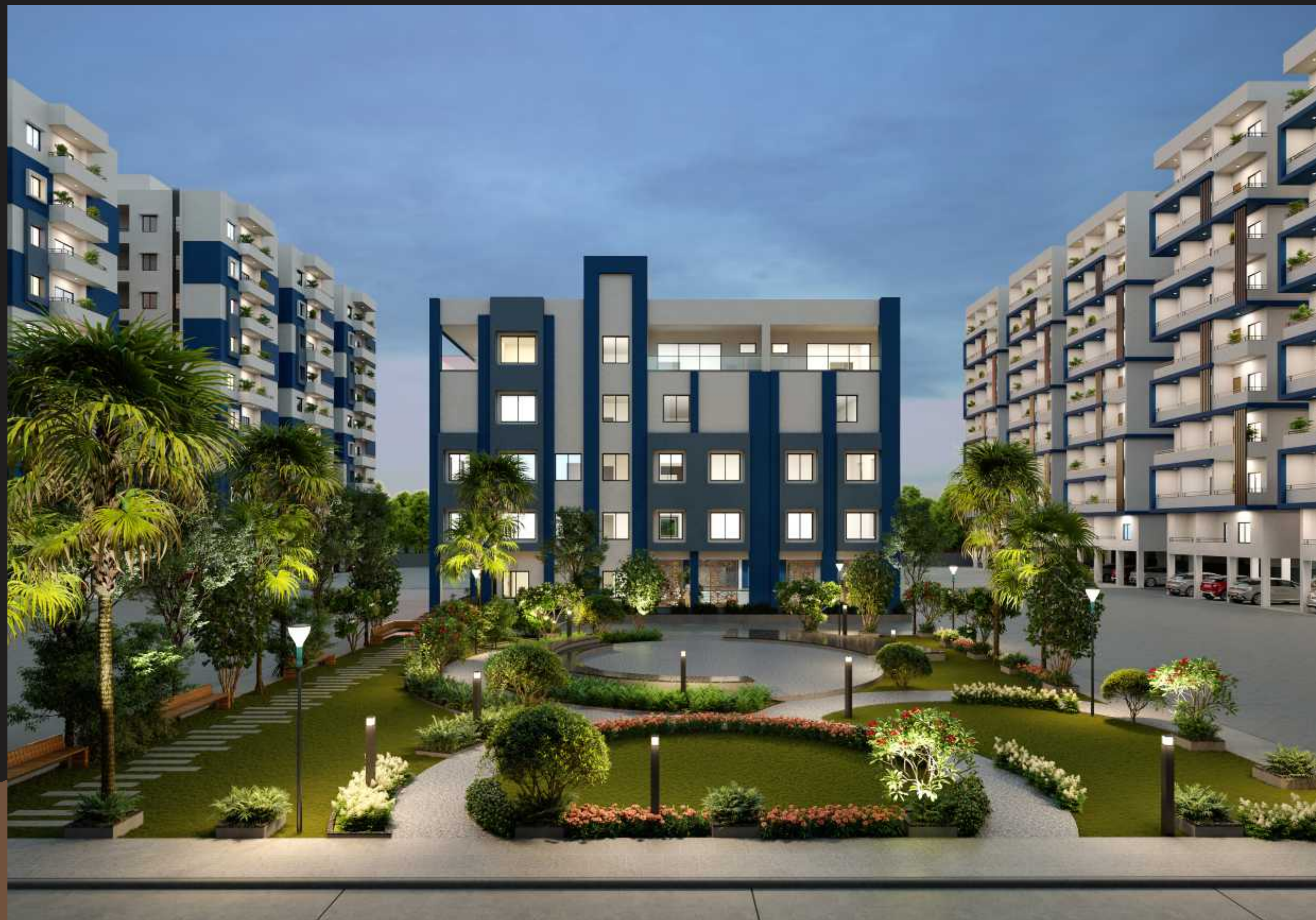
an artistic rendering of gbr dhawan courtyard view