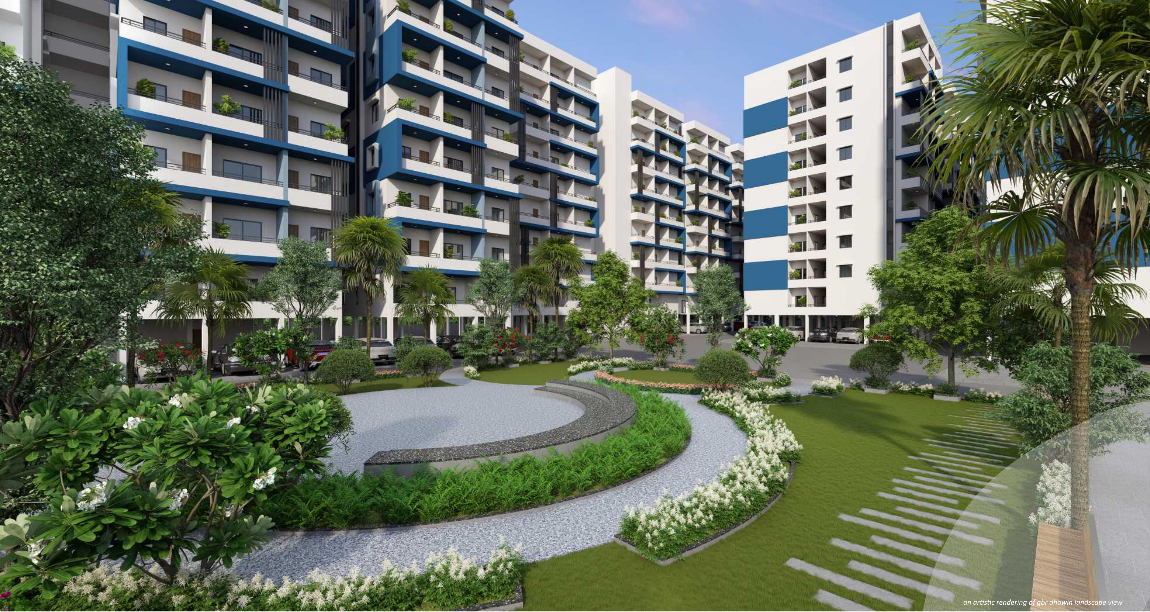
an artistic rendering of gbr dhanwin landscape view