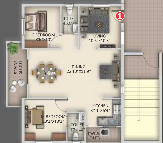
1 2BHK - 1165sft