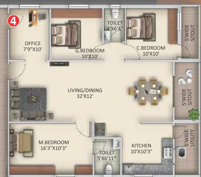
4 3BHK - 1670sft