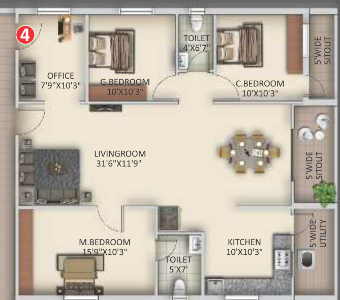
4 3BHK - 1650sft