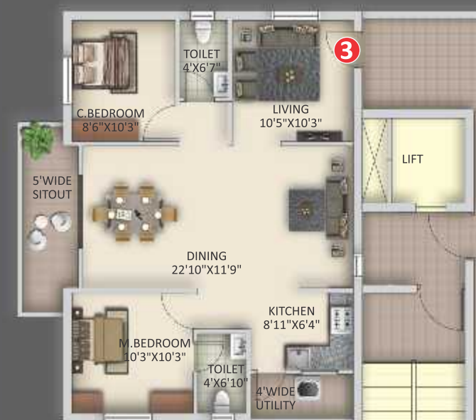
3 2BHK - 1165sft