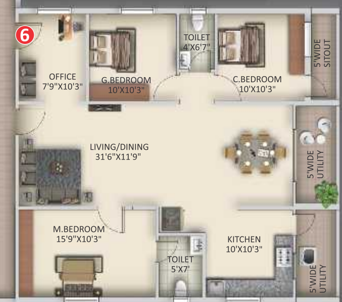
6 3BHK - 1650sft