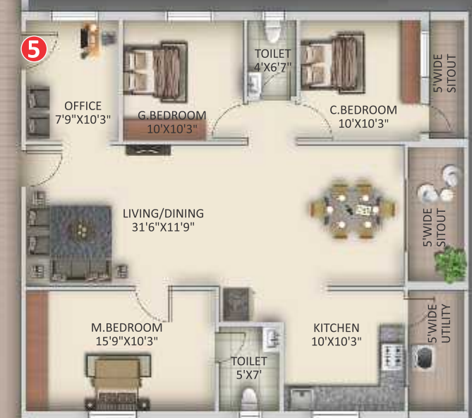
5 3BHK - 1650sft