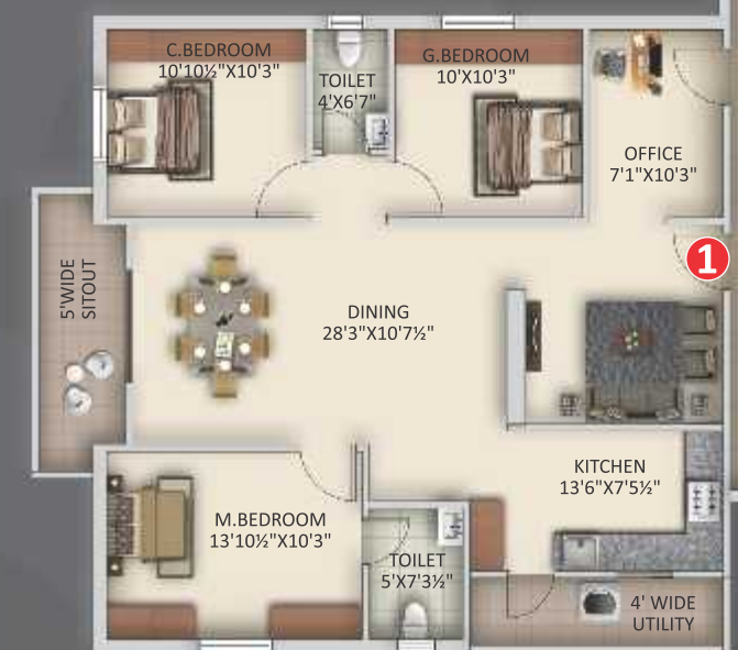
1 3BHK - 1570sft